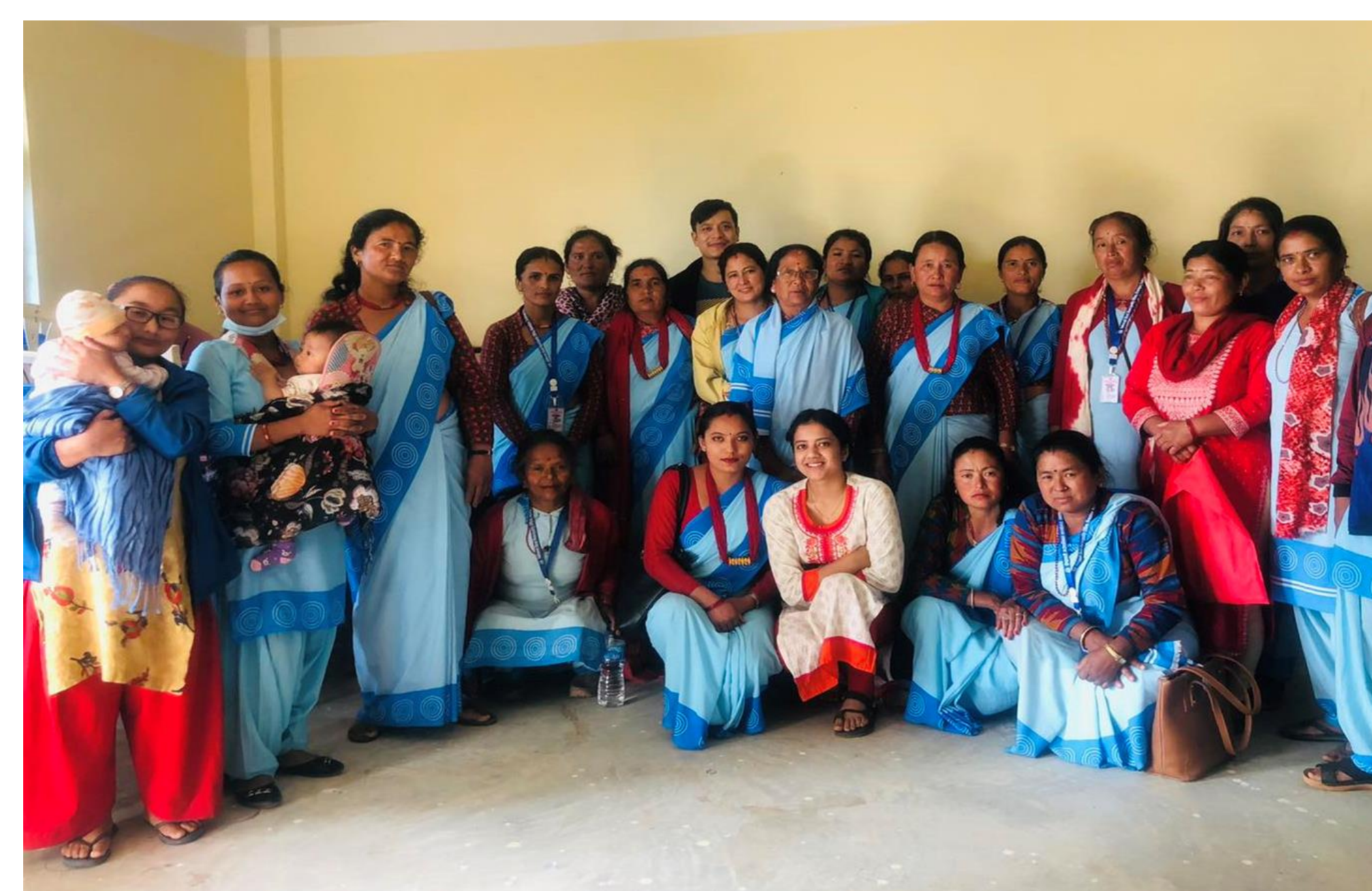
57 Female Community Health Volunteers ( FCHVs ) oriented on SRHR and cervical cancer