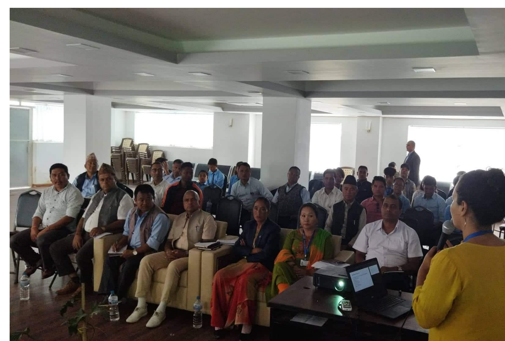
40 municipal stakeholders oriented on relevance and context of CSE and SRHR