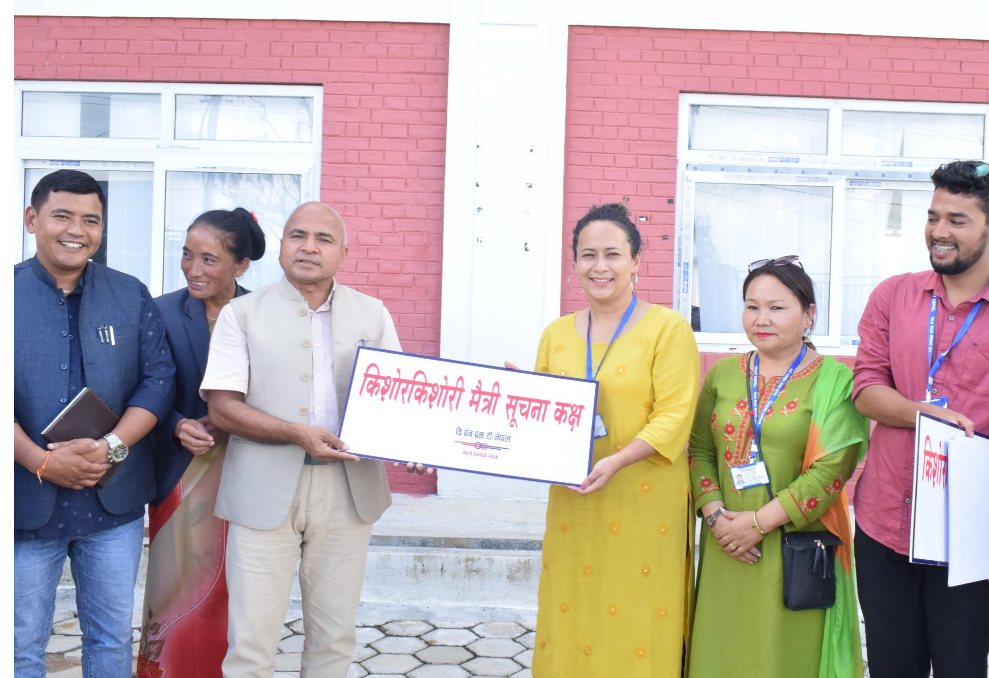
6 Adolescent friendly information corners established in 6 intervention schools