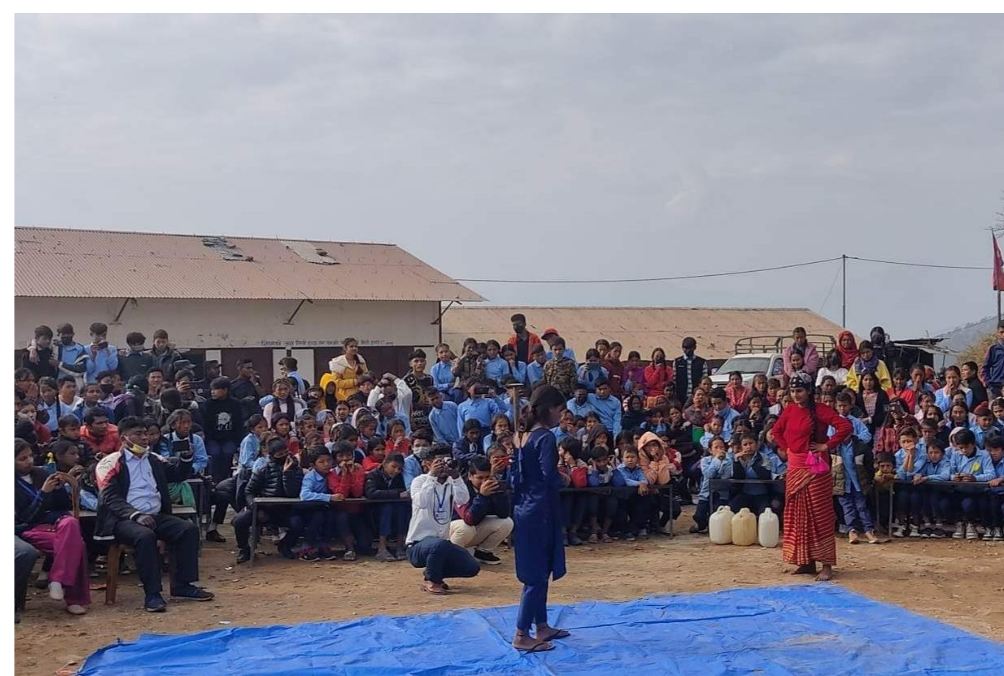
300+ community people observed municipal level SRHR Awareness program