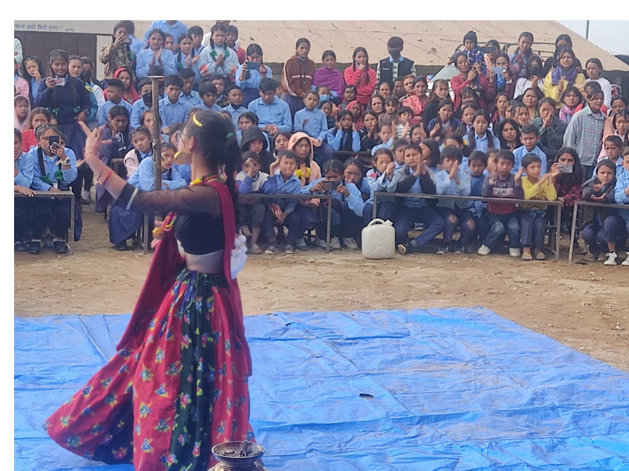
30 students performed in the cultural program to raise awareness on SRHR