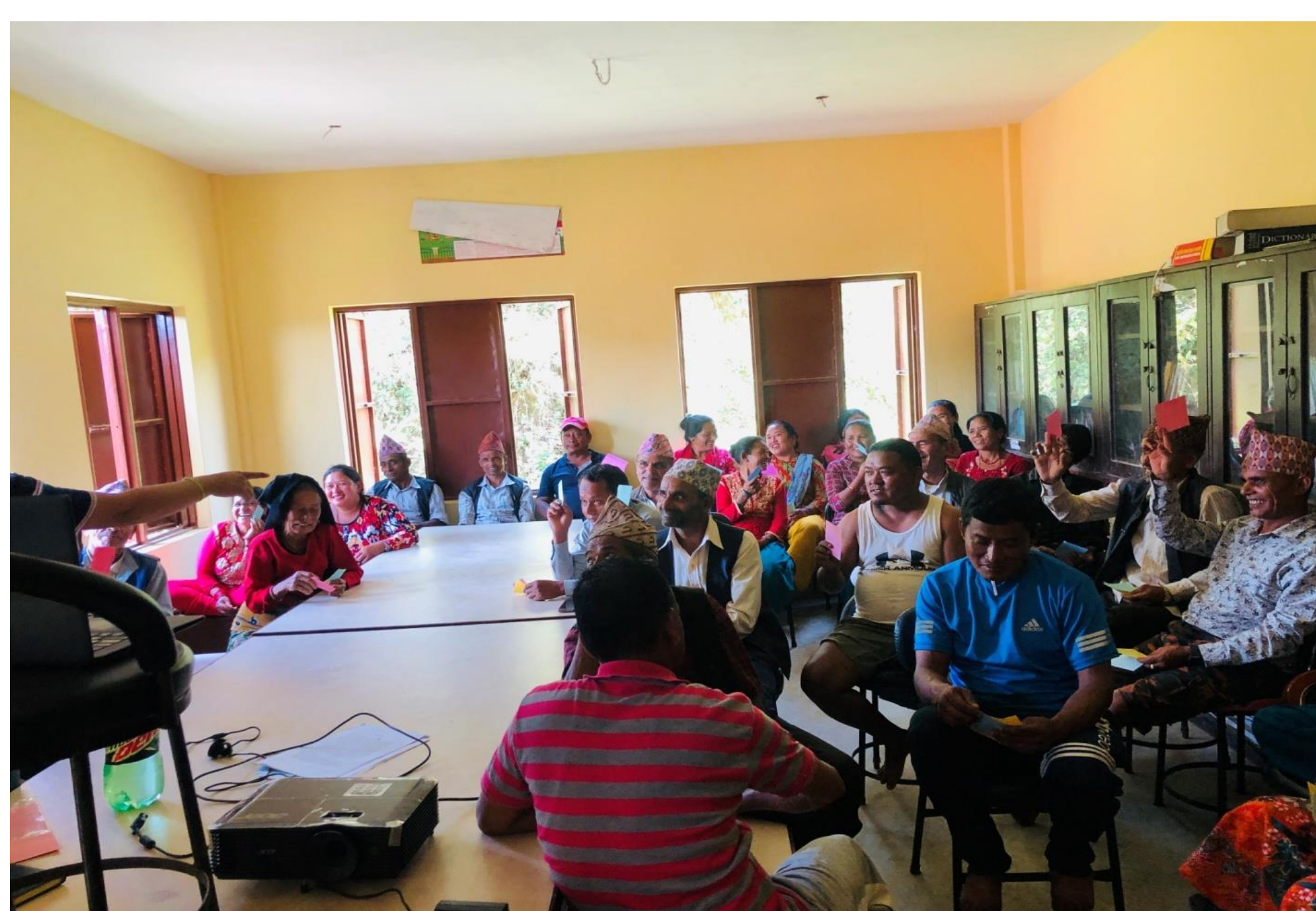
161 parents oriented on the importance on CSE and SRHR