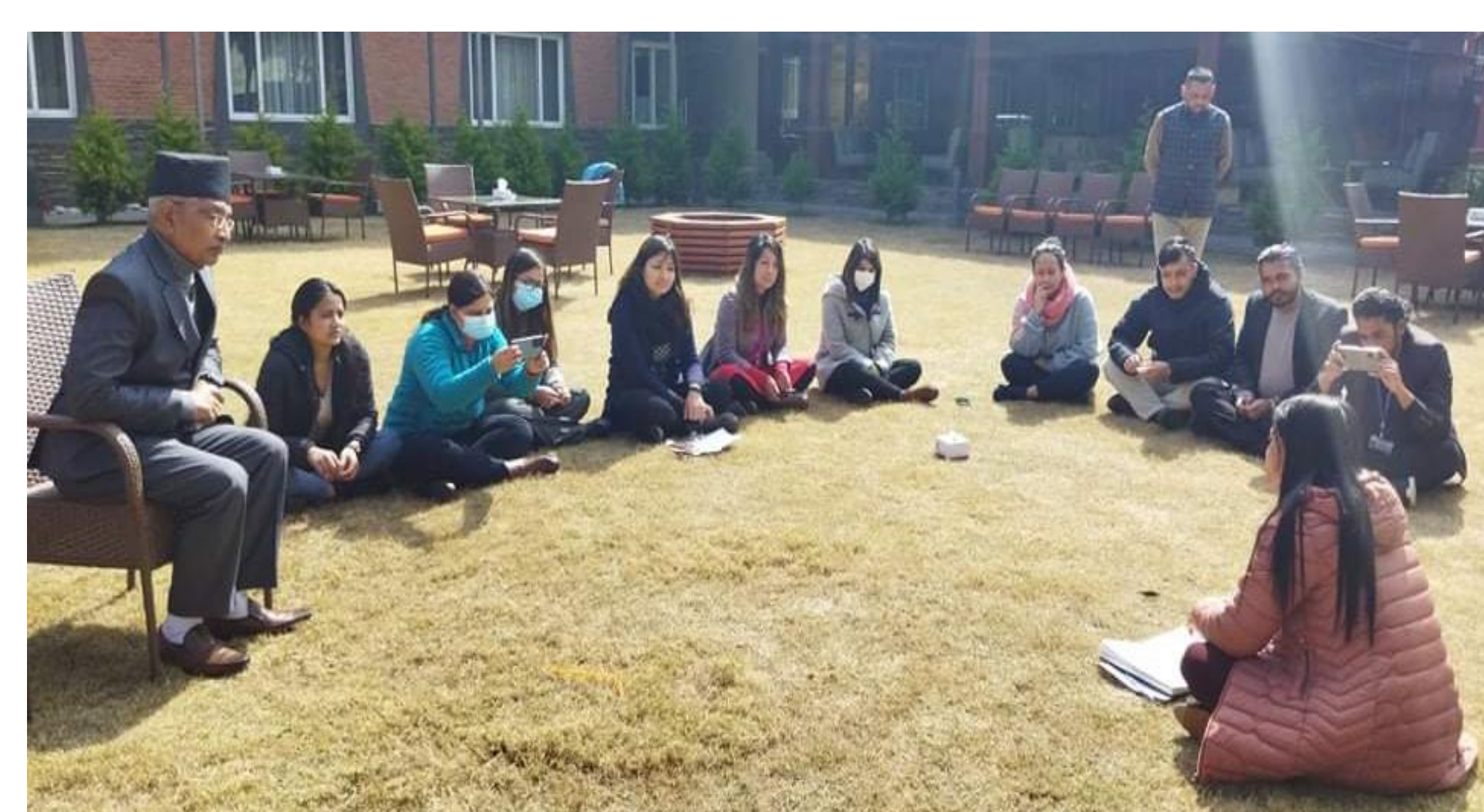
14 BNMT staff trained on SRHR and CSE