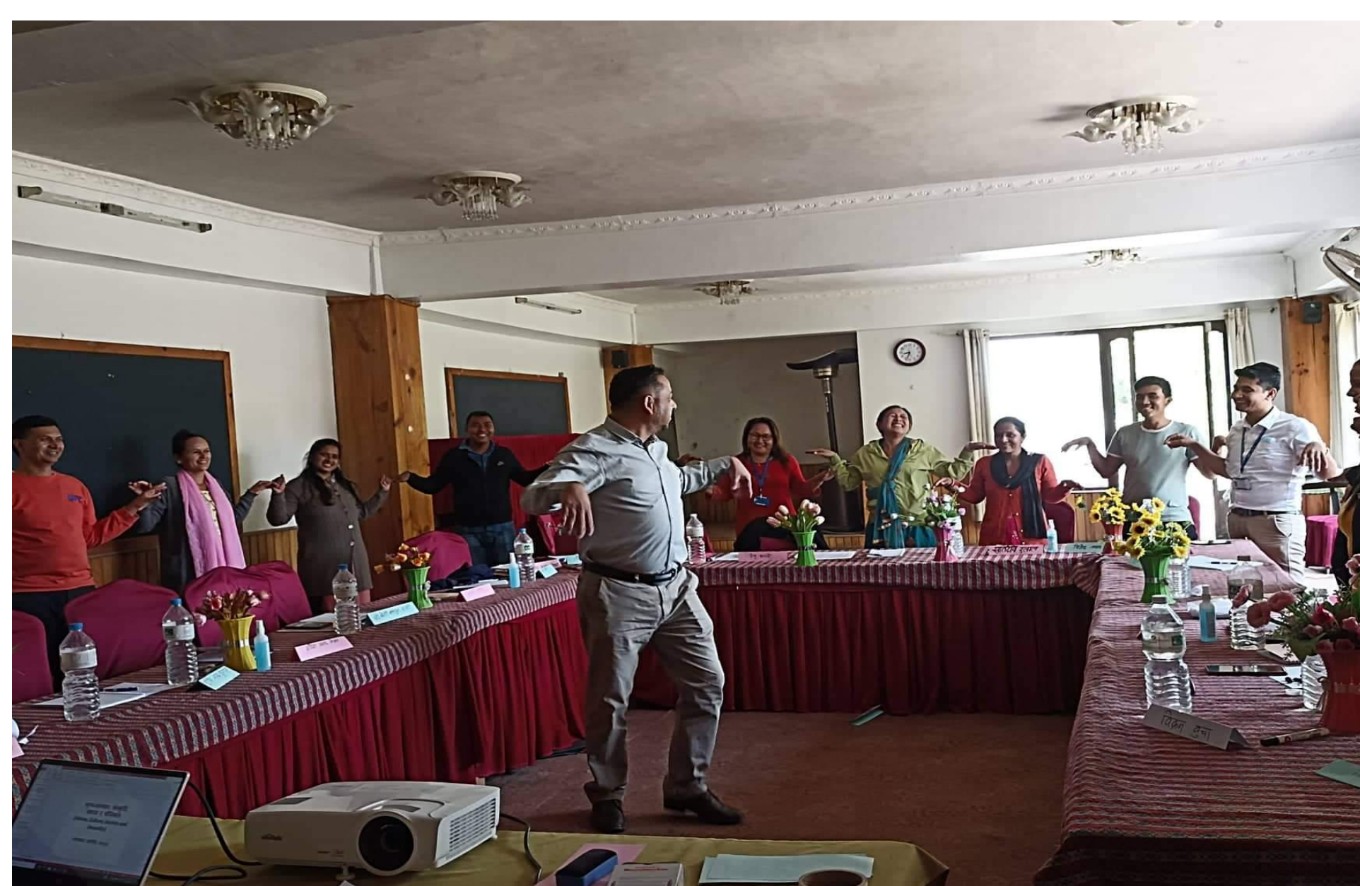
17 teachers trained on CSE