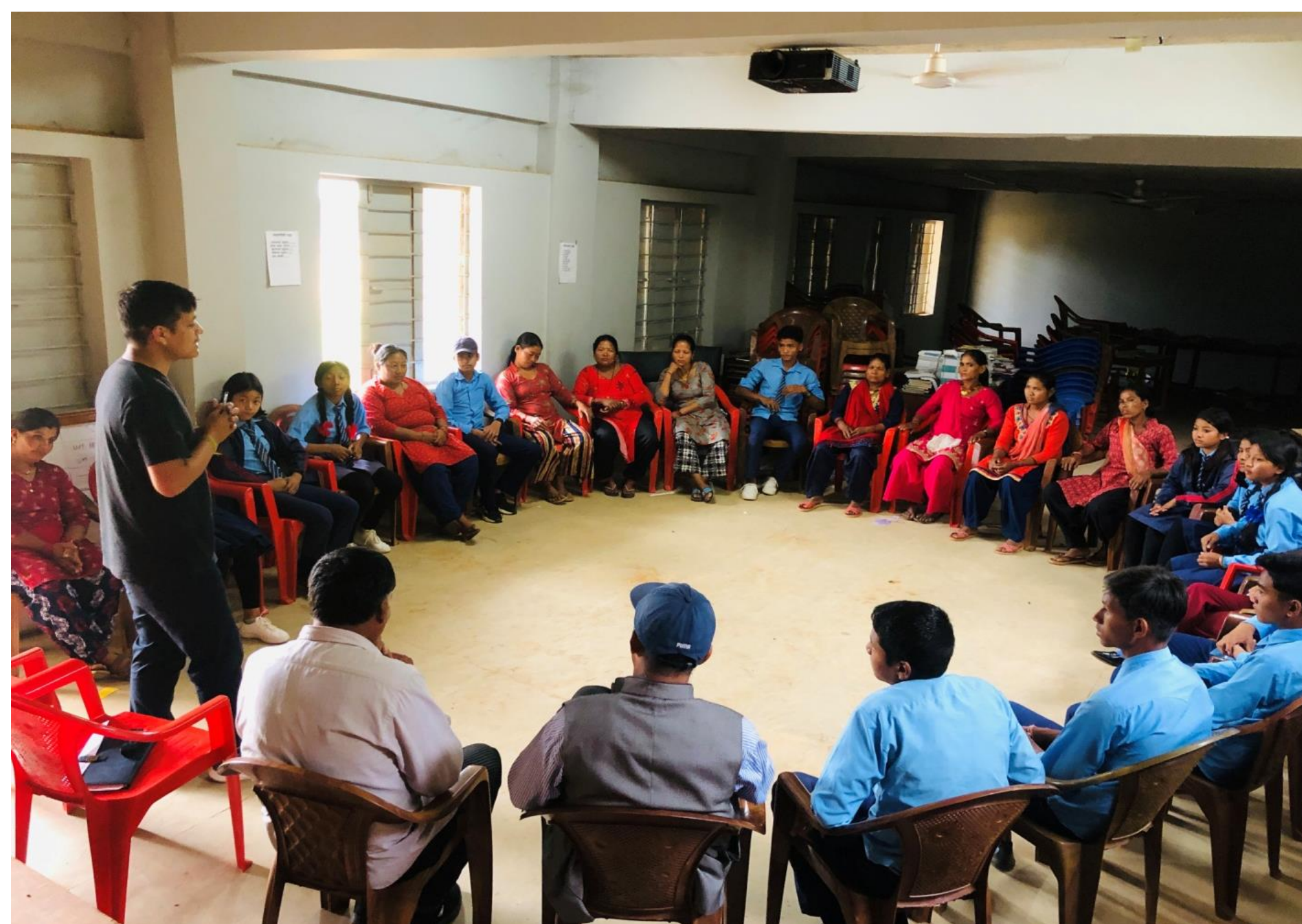
166 parents, teachers and students engaged in dialogues in 6 intervention schools