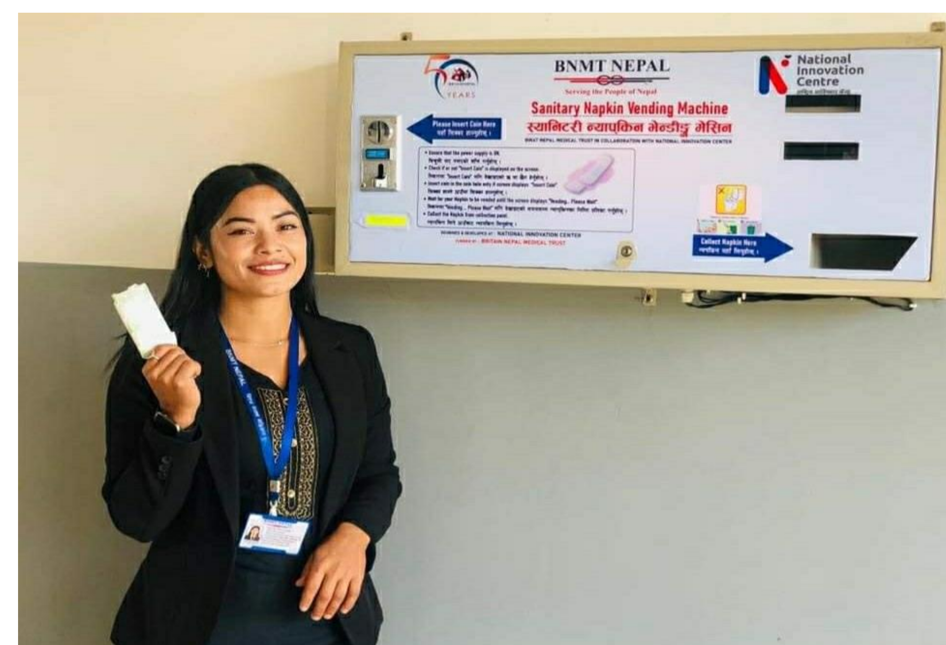
13 sanitary vending machines developed and distributed to 12 schools in collaboration with National Innovation Center