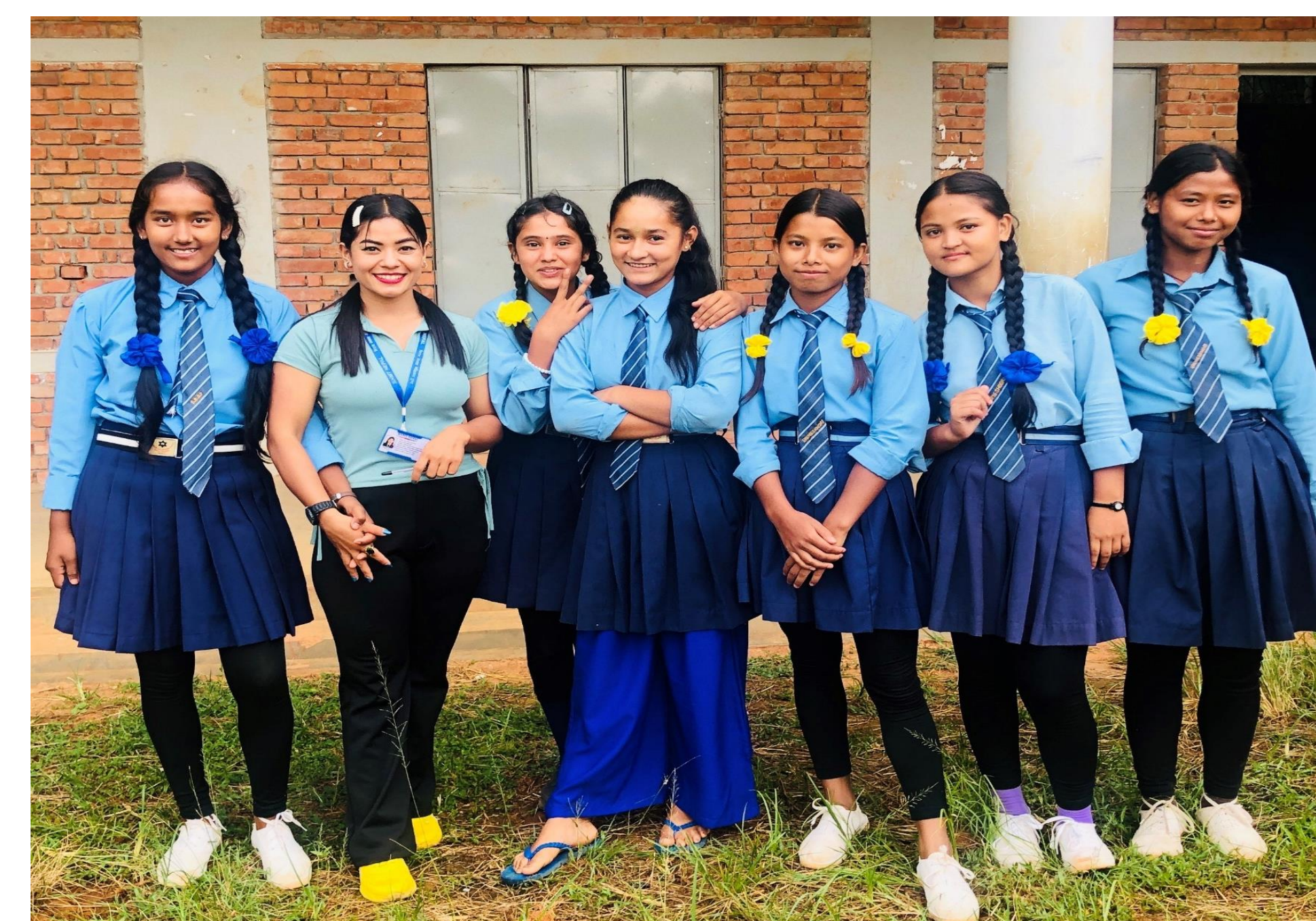
530 school adolescents Orientated on CSE