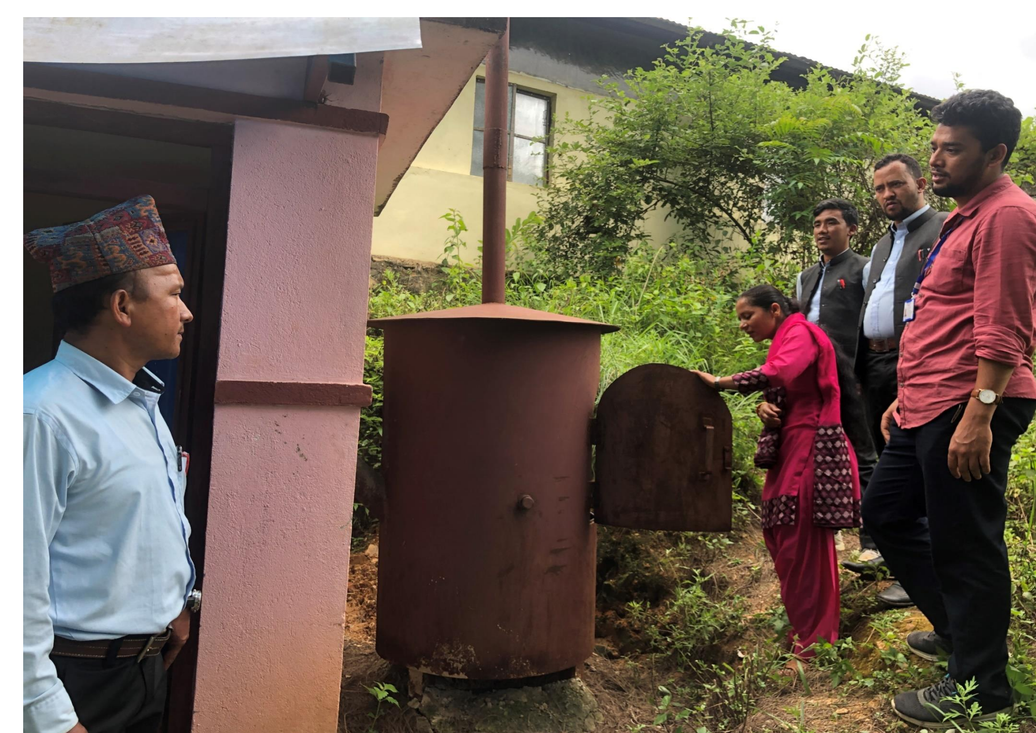
6 waste disposal pits constructed to improve Menstrual health and hygiene in the schools