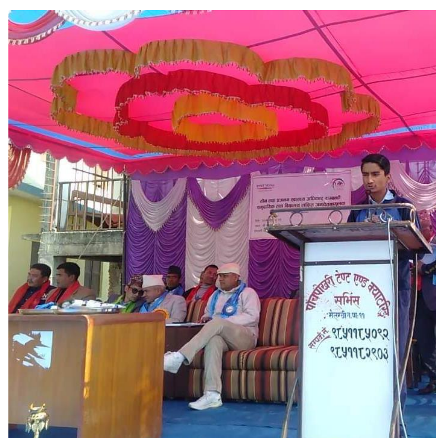
12 schools participated on Speech Contest - "Importance of Sexuality Education to adolescents"