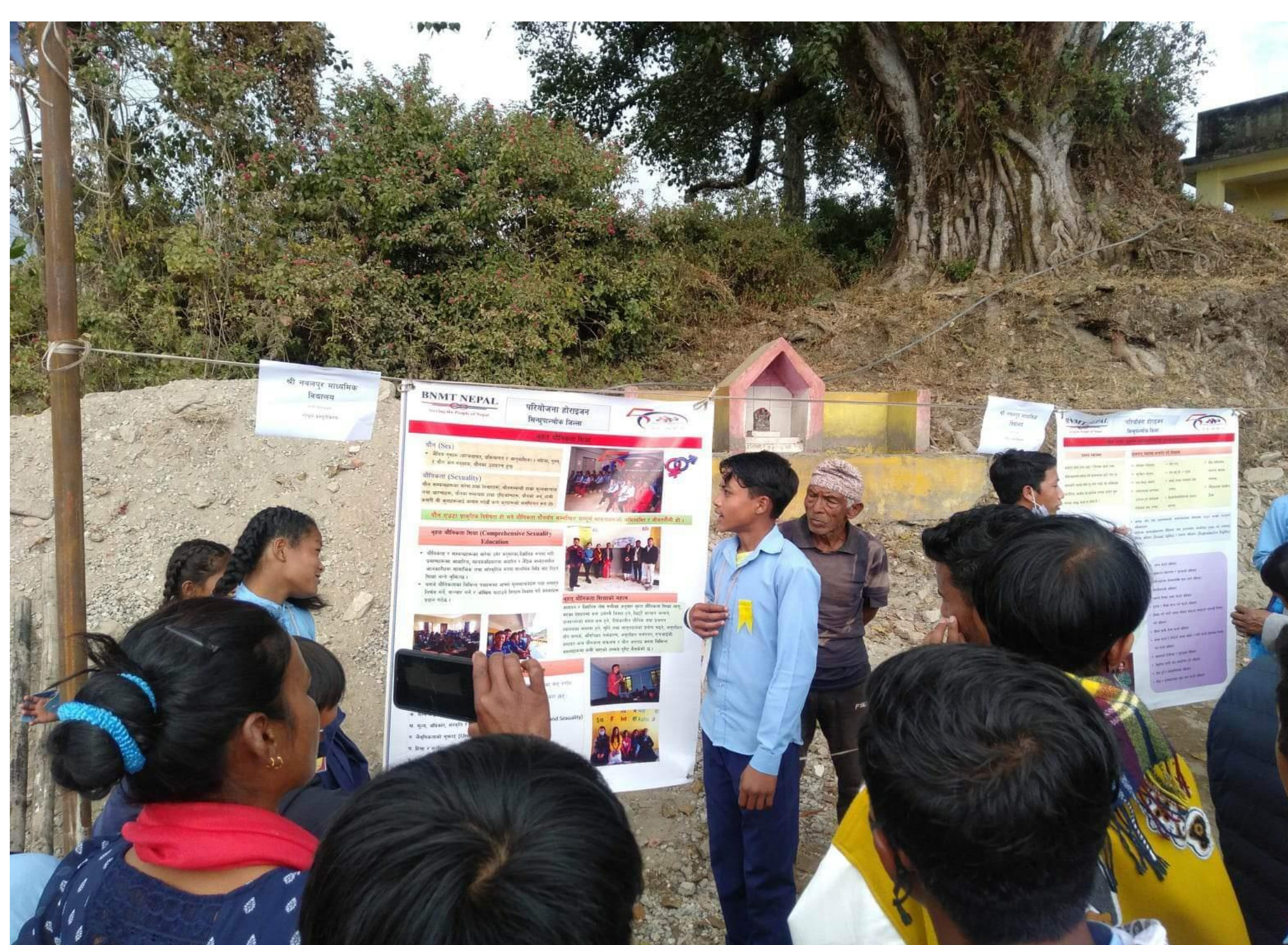
16 Peer educators poster presentations on SRHR